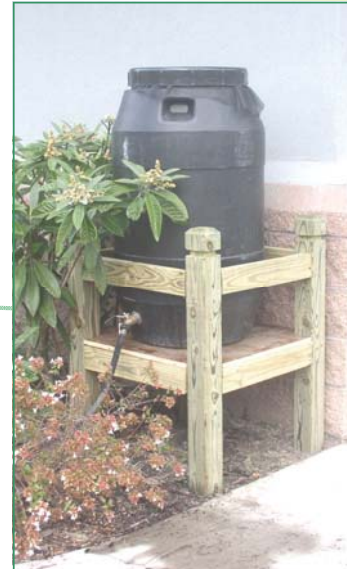
See this rain barrel at work at the Barnes Street Recreation Center in Florence.

1624 West Carolina Avenue Hartsville, SC 29550