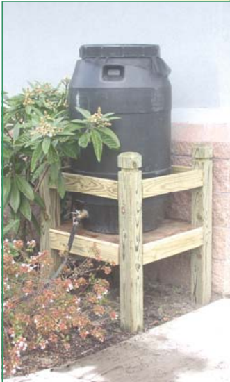
See this rain barrel at work at the Barnes Street Recreation Center in Florence.

1624 West Carolina Avenue Hartsville, SC 29550