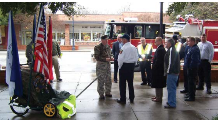
Citizens line up in front of City Hall to welcome Robinson.