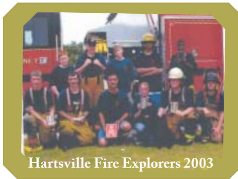
Hartsville Fire Explorers 2003

This program is suitable for both boys and girls.