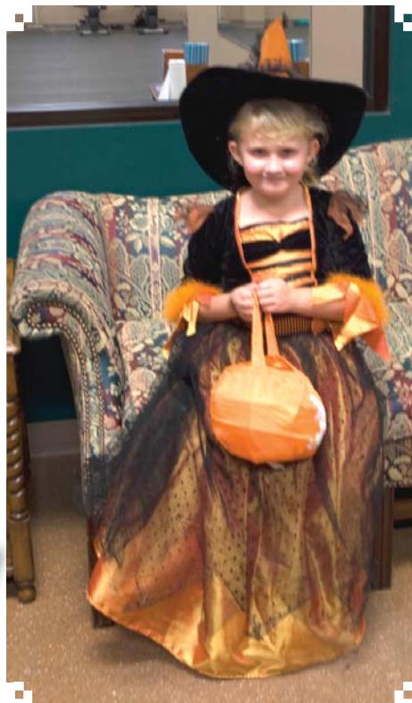
Right: what's Halloween without the witch? This little cutie perfectly fits the bill!