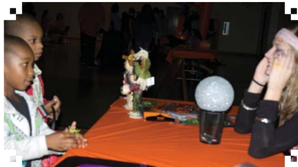
Above left: A new sheriff is in town; above right: these two youngsters listen as their fortune is told by a gypsy.